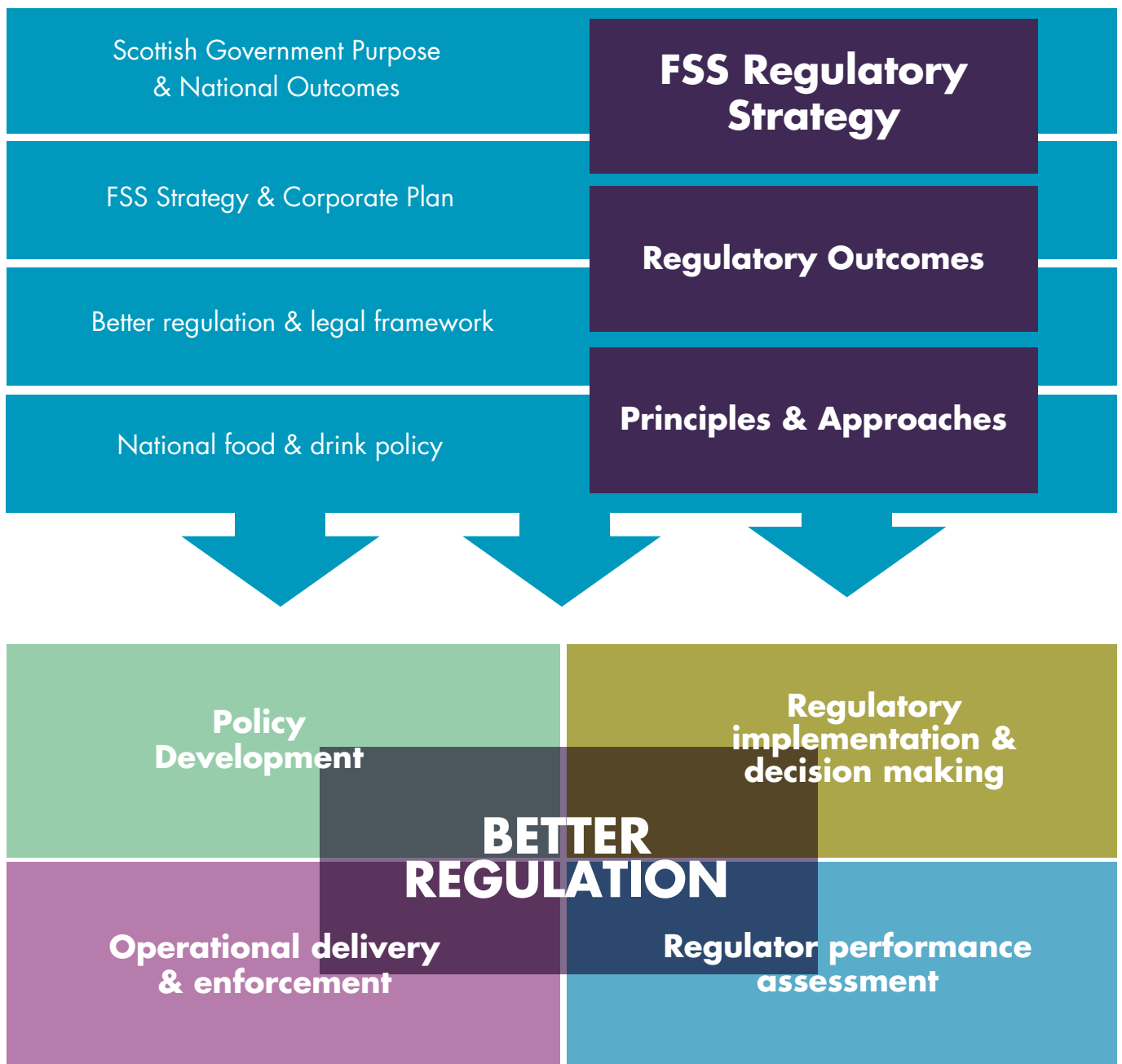
Figure 1. FSS regulatory framework

2.9 We will seek to integrate these principles and approaches across all of our policy and regulatory functions.