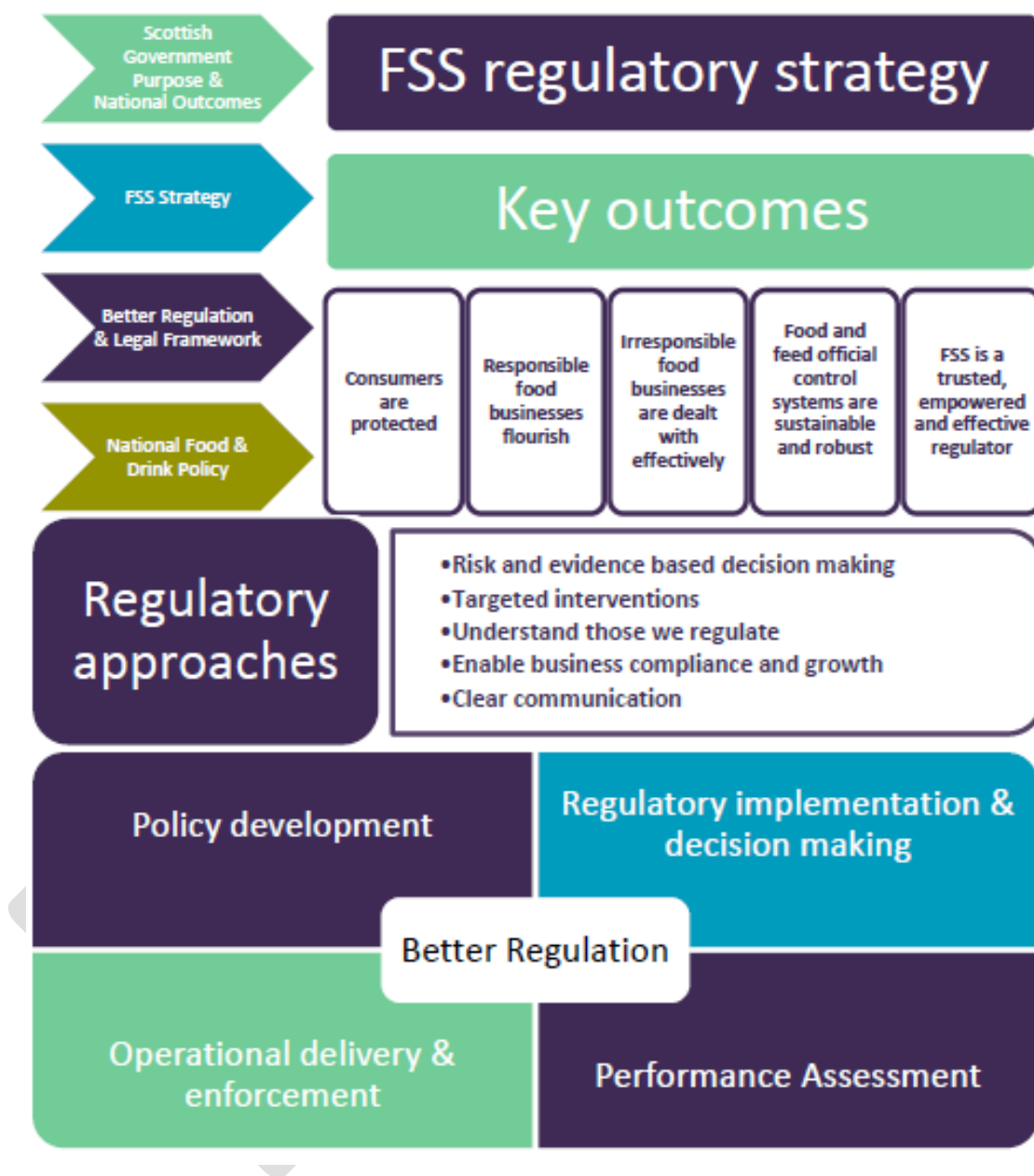
Figure 1. FSS regulatory framework

2.8 We will seek to integrate these elements across all of our policy and regulatory functions.